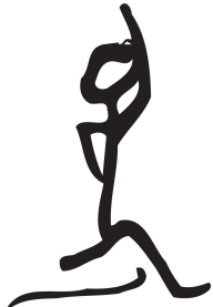
Gomukhasana Cow Face