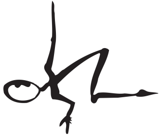
Threading the Needle