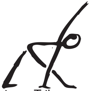
Parivrtta Trikonasana Revolved Triangle